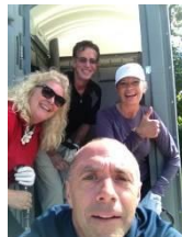
Team Perth Courier