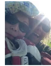
Team Calabogie Peaks Resort

Thank you to the participants for making our day a success!