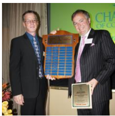
Business Achievement Award