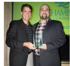
Young Entrepreneur Award