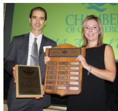
LLHBA Member Achievement Award