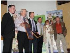
Business Achievement Winners Best Western Plus Perth Parkside Inn & Spa