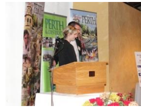
Young Entrepreneur Award Cat's Cove Writing