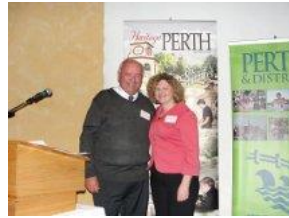
LLHBA Member Achievement Lambden Window & Door Sales Ltd.